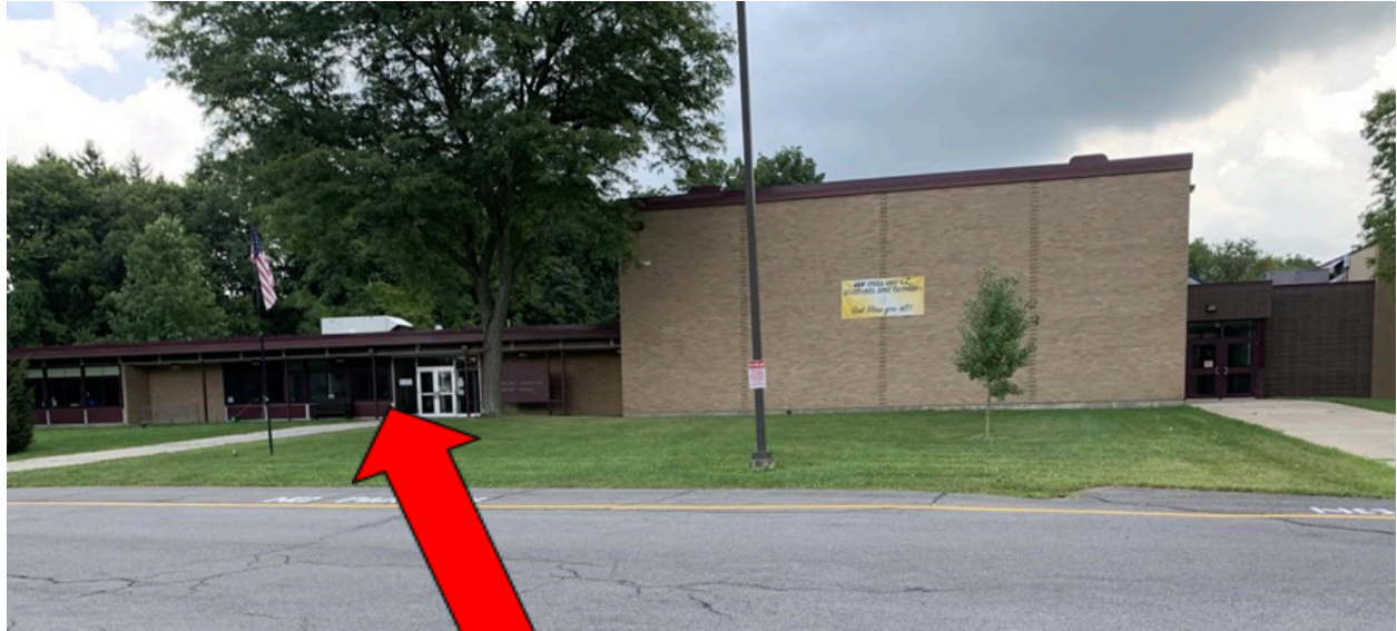
Bus Drop Off and Pick Up / (Parent Drop Off and Pick Up During School Hours)