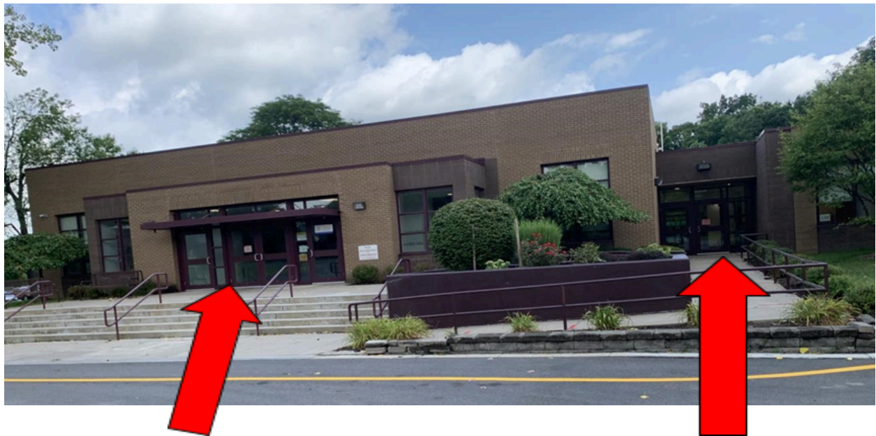
Parent Drop Off and Pick Up Entrance